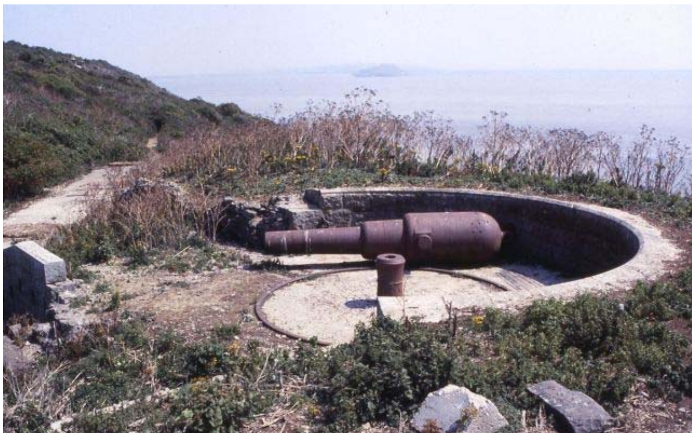
Split Rock Battery